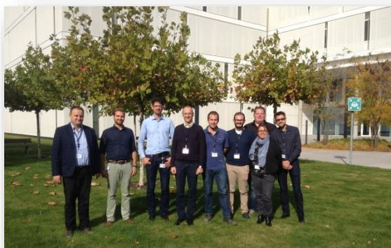
All partners gathered at the Heraeus headquarters Hanau, Germany, 17 th October 2018.