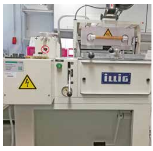
Thermoforming machine ILLIG KFG 37