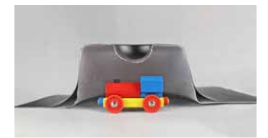
Composite of XPS and PS