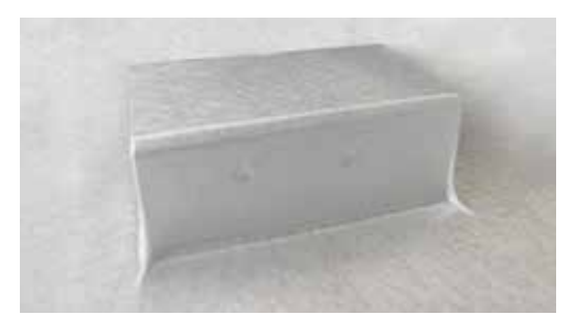
Foam sheet cuboid